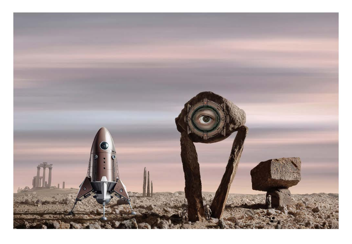
Martian Monuments by Dale O'Dell

Contemporary Photography in an Al Future