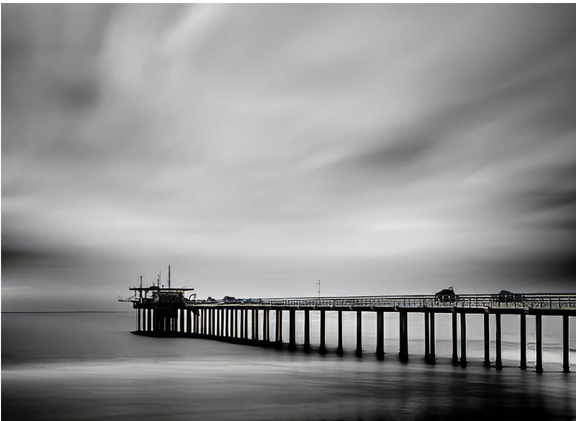
Scripps Pier by Tom Klare

Capturing the Unseen: Techniques for Showing Motion in Photos