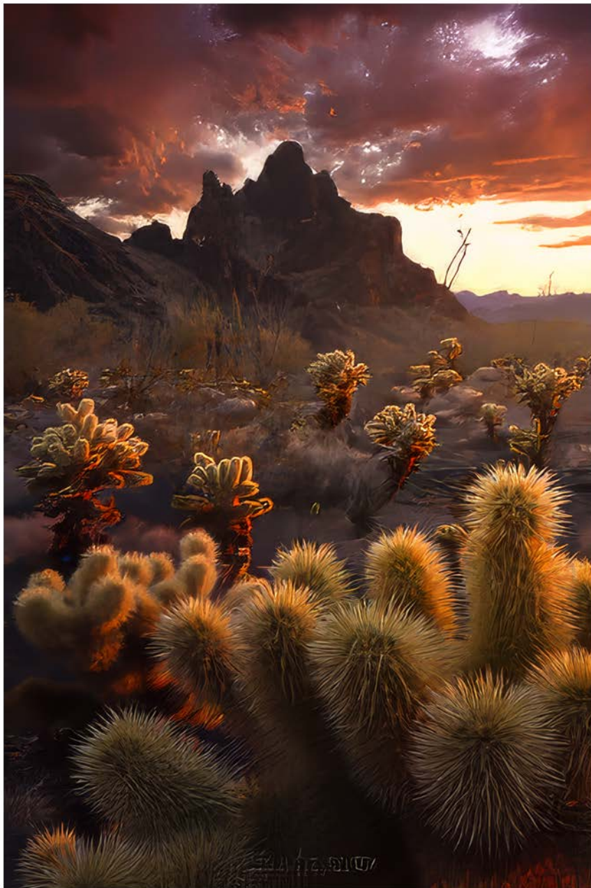
Desert flames by Joshua Snow

Join Joshua as he presents "Capturing a Dream", a look into the creative side of landscape and astrophotography. Snow will delve into the ins and outs of creating captivating imagery and bringing it to life through post processing. Bridging the gap between single exposure photography and imaginative digital art, Josh employs over 12 years of experience in the world of post processing and photography to create his signature work.