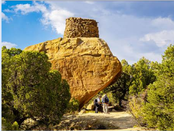
Under the Ruins by Tom Wardrup