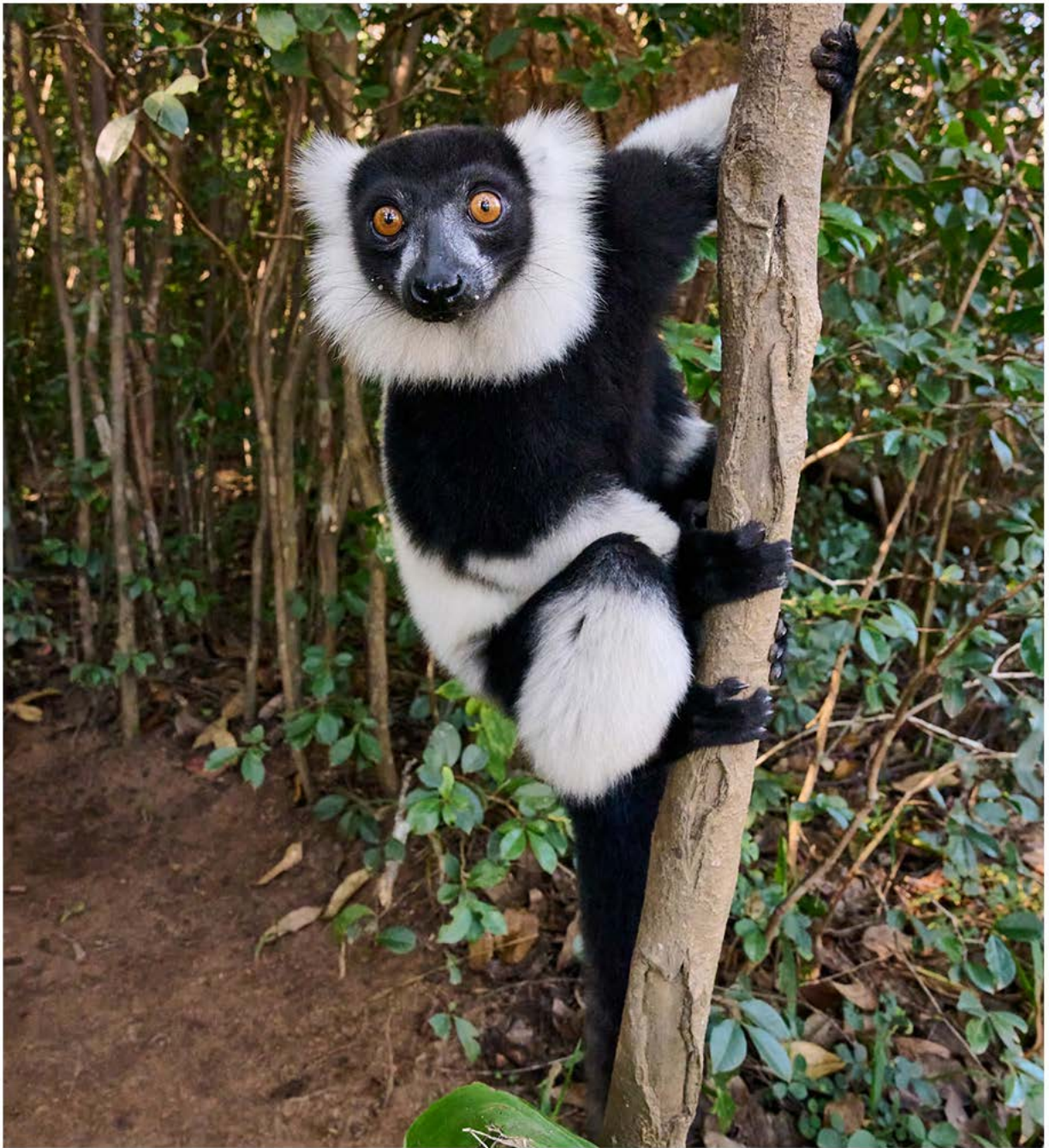
Ruffed Lemur

Tips and Techniques for Wildlife Photography