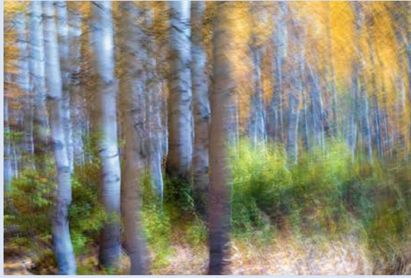
Marcos River Aspen