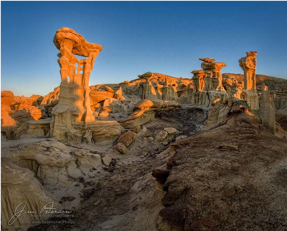
Day's End at Alien Throne by Jim Peterson

I led a trip to Colorado's San Juan Mountains and the badlands of northwestern New Mexico. The photo above is from the badlands. The trip for me was an intensive-but-glorious return to what I consider my native territory, and it was successful and enjoyable in every way. We endured just about every imaginable kind of weather except tornadoes and hurricanes (rain, snow, sleet, hail, wind, dust, and very close lightning bolts - plus spectacular sunshine, sunrises, sunsets, night skies, and storm clouds). We harvested uncountable billions of pixels and tromped through mountains, hills, canyons, mud, creeks, and off trail wilderness to capture them (guided, in one case, by the former Mayor of my home town). The scenery and landscapes were (not surprisingly) spectacular, and the autumn leaves were superb except, paradoxically, at the one spot we expected them to be the best. And the company was great too!