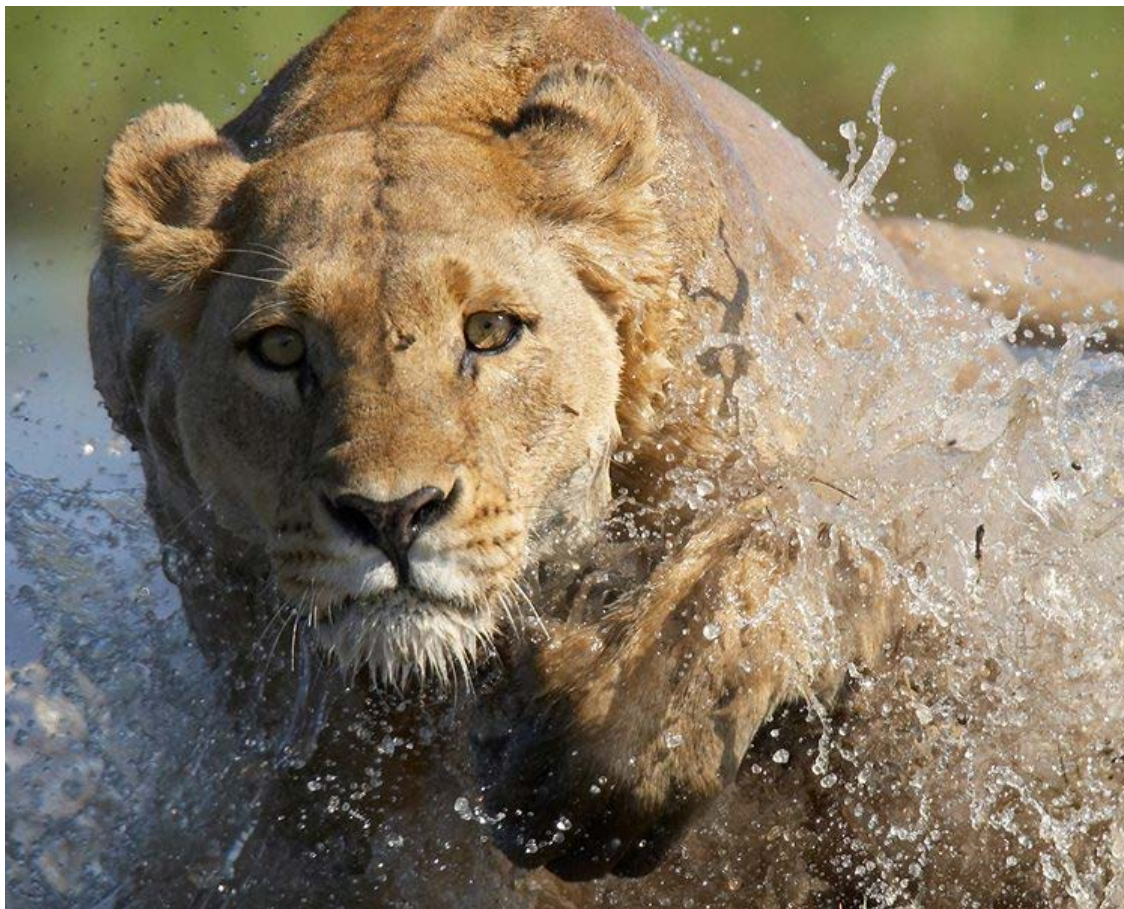
Don't Run! by Bruce Dorn