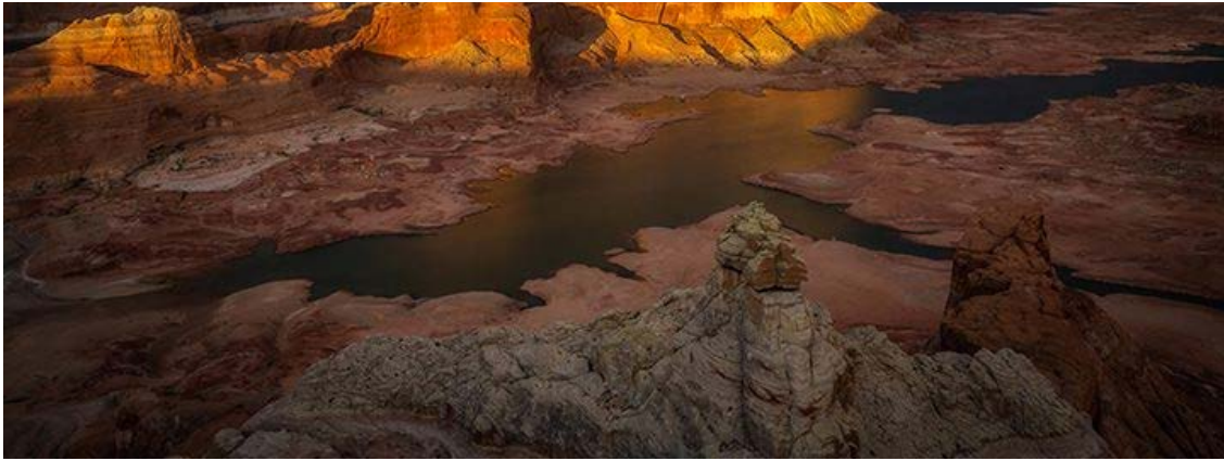
Alstrom Point Sunset